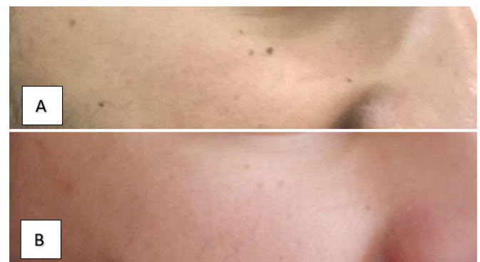
Figure 2. Before (A) and one month after the last therapeutic session (B)