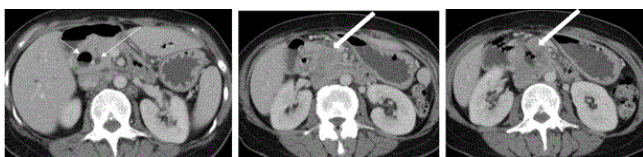
Figure 1: abdominal CT images showing a cavitory mass lesion (thick arrows) involving inferior part of pancreatic head with obliteration and proximal dilatation of the pancreatic duct (long thin arrow) and common billiary duct (short thin arrow).

Patient was a healthy and well 55 year-old woman with 3 children till having an abdominal pain for 2 months before being visited in November 2016. Past medical history was not significant and she had no jaundice or pruritis or other symptoms of billiary obstruction. There was no history of smoking or gall stone, alcohol consumption and also family history was not significant. Complete blood count, renal and hepatic function tests and urine analysis were normal. In abdominal sonography a pancreatic mass found and the abdominal, pelvis and chest CT scan was done showing a lesion in the head of pancreas and no other lesion (fig 1).